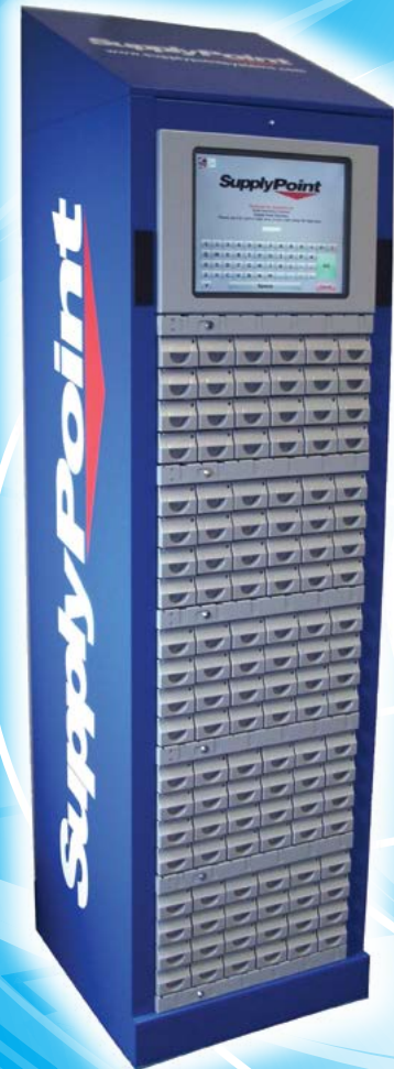
High capacity secure solutions

Designed and manufactured in the UK, Modulo incorporates industry leading and award winning technology by Supply Point Systems to provide a higher capacity machine at a very competitive cost.